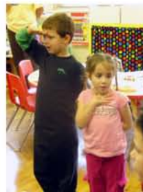
Daily Pledge and Prayers