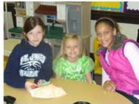
Big Buddies and Little Buddies spending time together