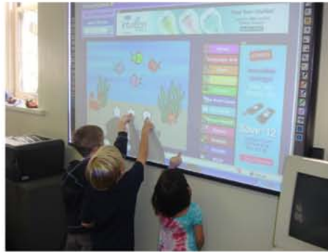
Learning with the latest Technology

Please contact our school office for tuition and fees. (502)454-0330 ext. #11 or by email ebyers1@stjamesbluejays.com