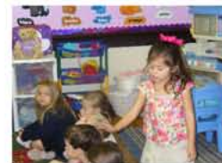
Playing Games Together