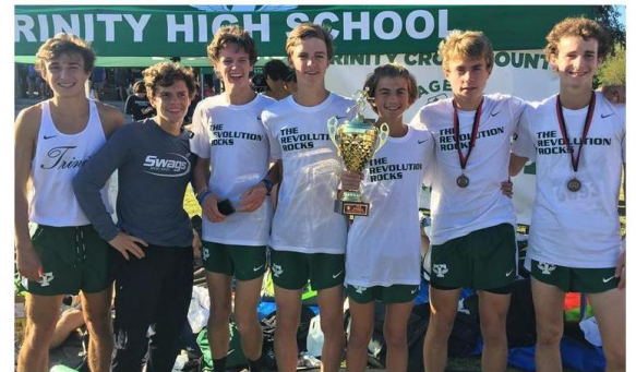
Members of the 2016 Cross Country Team claiming the 1st place trophy at the prestigious Alexander-Asics Invitational in Atlanta, GA

Cost (Includes camp shirt): $50 before July 15 $65 after July 15