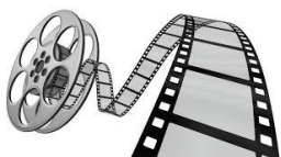
Family Movie Night